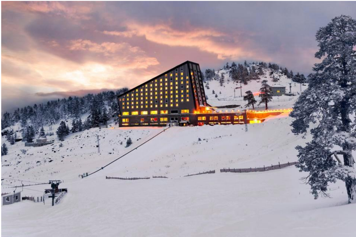
Kaya Palazzo Ski & Mountain Resort

Picture a full day of skiing, a quick jump in your outdoor jacuzzi, then a delicious gourmet meal followed by nightclub DJs and a roaring fireplace before bed. Now imagine that instead of the slopes of Aspen or the Swiss Alps you're actually in northern Türkiye (the newly-preferred name of Turkey). Hard to picture? Surprisingly enough the country can provide that same luxury ski trip, along with some Turkish touches, to make the perfect winter vacation.