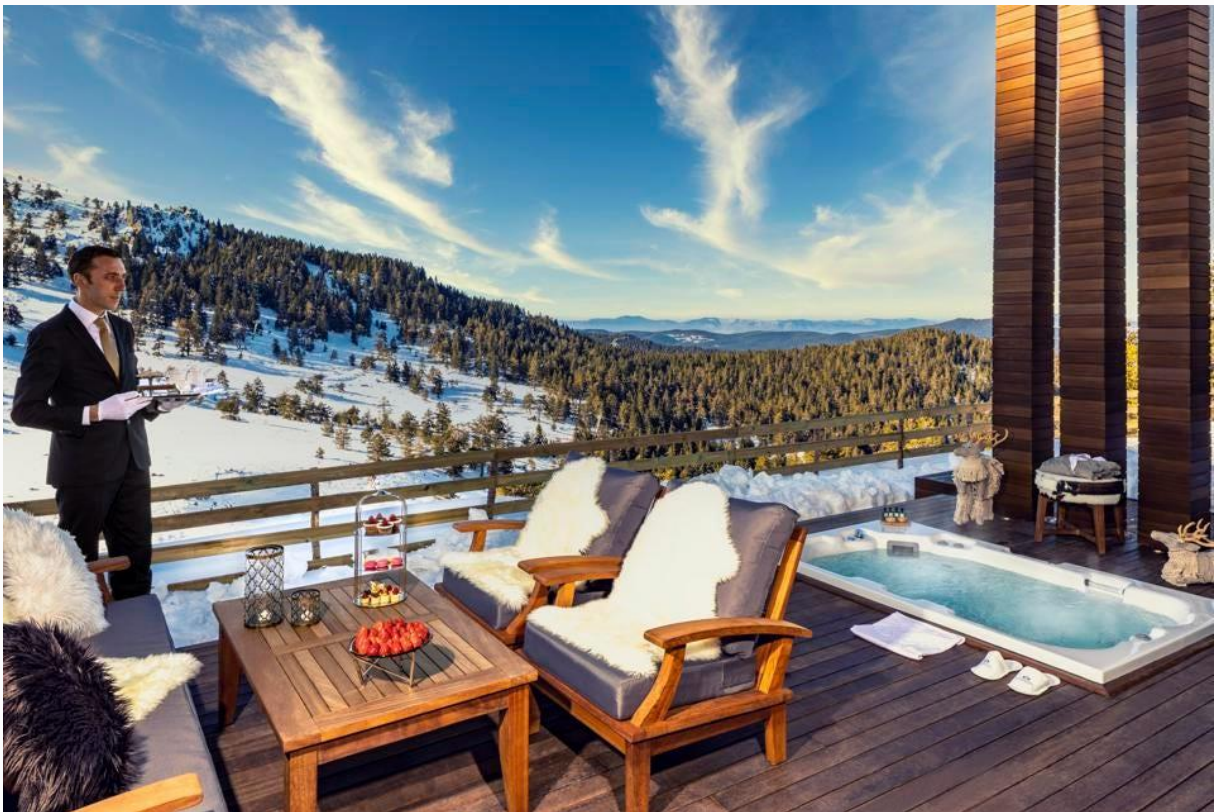
Outdoor jacuzzi at the Chalet overlooking the slopes

Kaya Palazzo Ski & Mountain Resort , which opened in 2011, is located in Kartalkaya in the Köroğlu Mountains, roughly a four hour drive from Istanbul or two hour drive from Ankara. The main hotel, sloped like a ski jump, has 139 rooms and suites, including 9 Grand Suites with in-room jacuzzis, living room and electric fireplaces and a luxurious 2-bedroom King Suite. The Junior and Deluxe suites also have in-room jacuzzis. English is one of the official languages of the resort, so U.S. Visitors will easily be able to coordinate all activities and interact with hotel staff.